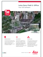
Leica Zero Field & Office