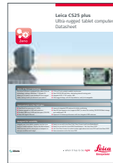
Leica CS25 plus