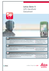
Leica Zero 5

Copyright Leica Geosystems AG, 9435 Heerbrugg, Switzerland. All rights reserved. Printed in Switzerland – 2017. Leica Geosystems AG is part of Hexagon AB. 855252en – 03.17