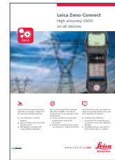
Leica Zero Connect